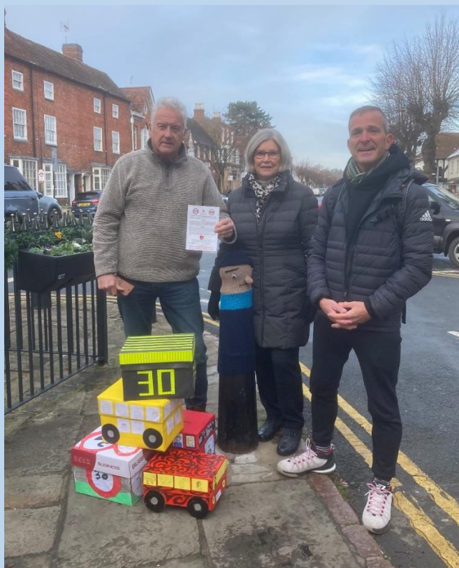
The CSW team